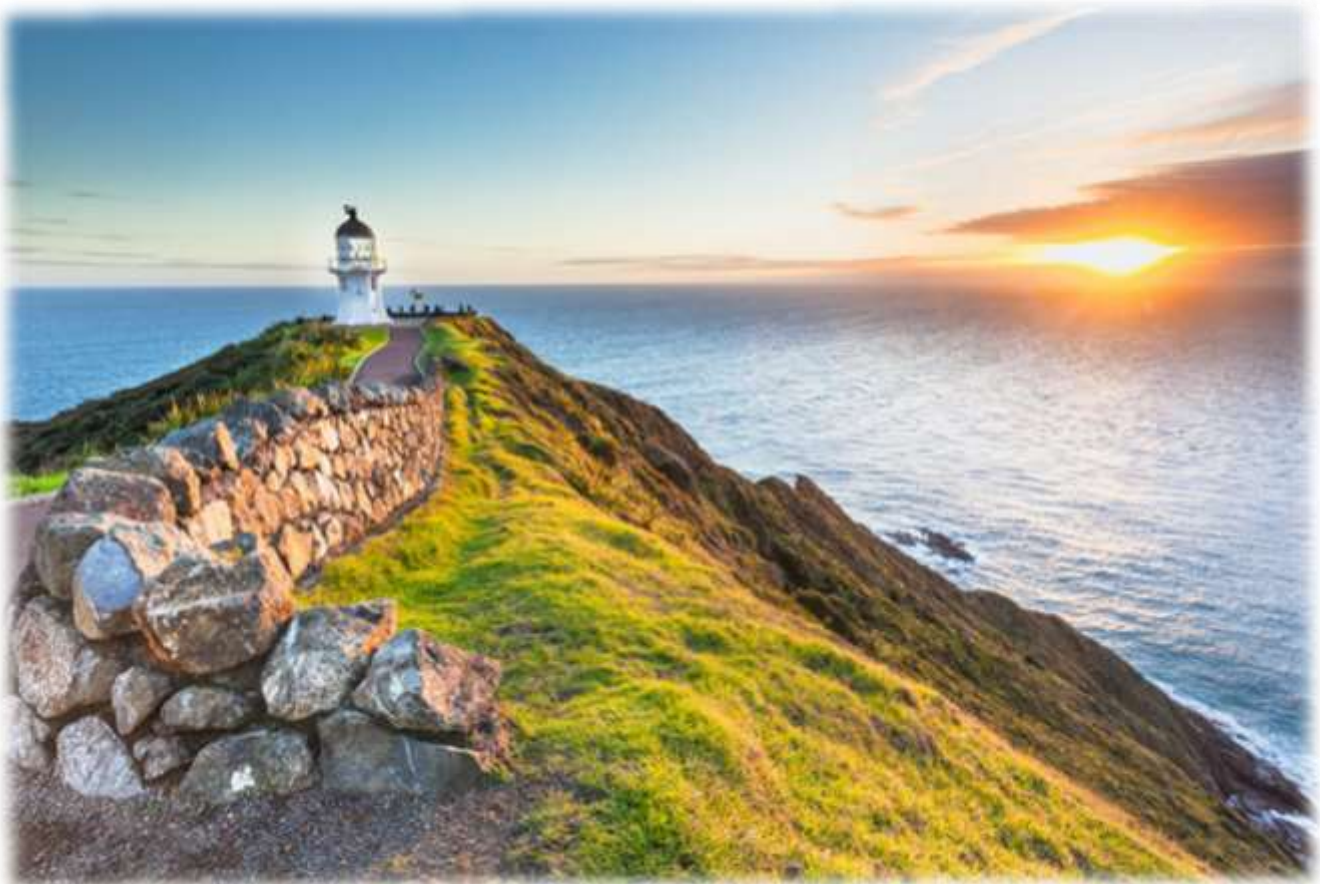
Te Rerenga Wairua - the leaping place of spirits

Tēnei mātou katoa Te tangi atu nei Kia kōutou e ngā Ariki Ki tō mātou hoa Kua riro atu nei Manaakitia mai Tōna wairua Kua tomo atu nei Ki tou torona Hei anahera tapu Māu e Ihoa