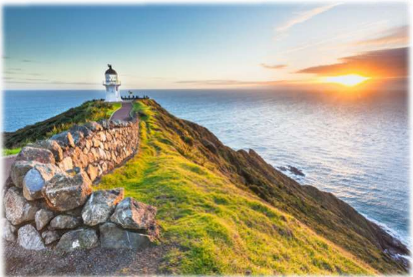
Te Rerenga Wairua - the leaping place of spirits

Tēnei mātou katoa Te tangi atu nei Kia kōutou e ngā Ariki Ki tō mātou hoa Kua riro atu nei Manaakitia mai Tōna wairua Kua tomo atu nei Ki tou torona Hei anahera tapu Māu e Ihoa